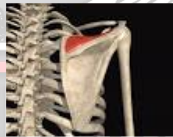
Supraspinatus Muscle & Tendon

Muscle is tissue that can contract to provide mobility and strength. Tendons are structures that connect muscle to bone.