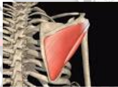
Infraspinatus Muscle & Tendon